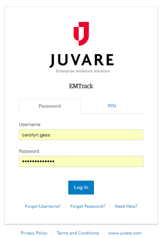
© 2018 EMSystems LLC. EMTrack® 4.0.0

Simple visual enhancements on the login page, header, and footer provide a more modern and consistent look across Juvare solutions, and simultaneously streamline your access to key features and important information.